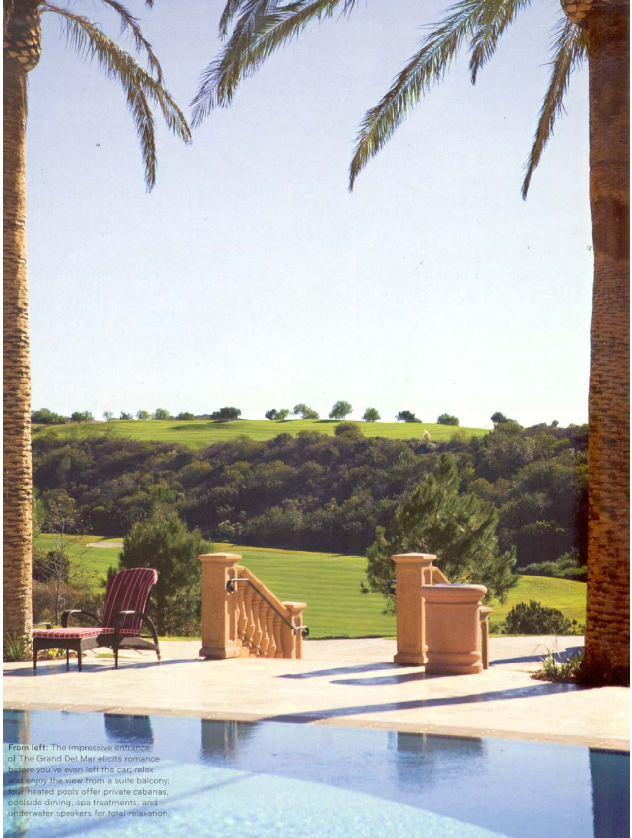
From left: The impressive entrance of The Grand Del Mar elicits romance before you've even left the car; relax and enjoy the view from a suite balcony; four heated pools offer private cabanas, poolside dining, spa treatments, and underwater speakers for total relaxation.