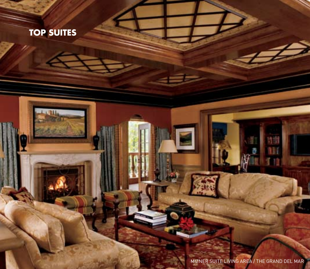
MIZNER SUITE LIVING AREA / THE GRAND DEL MAR