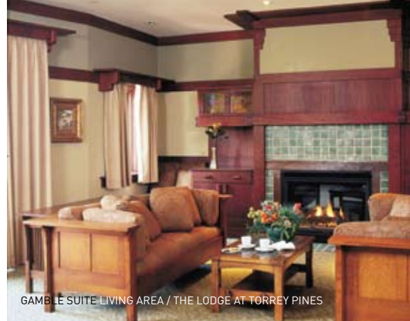
GAMBLE SUITE LIVING AREA / THE LODGE AT TORREY PINES